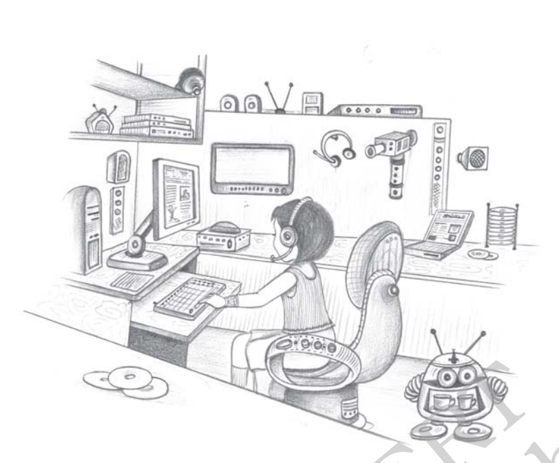
The mechanical teacher was flashing on the screen...

because her mother said little girls learned better if they learned at regular hours.